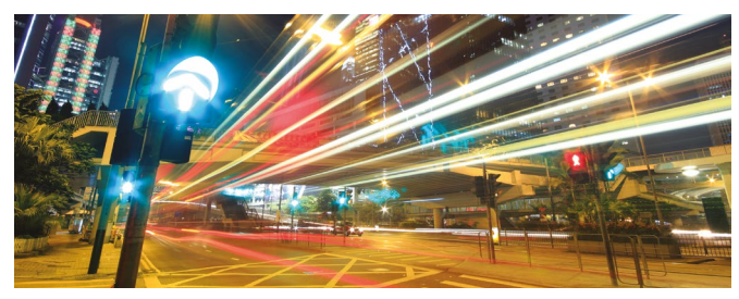
Traffic & Pedestrian Control